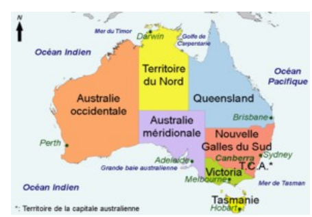
In 1926, the Australian colonies became independent. And since October 19th, 1926, Australia Commonwealth.