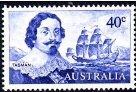
The island was seen for the first time by Abel Tasman in 1642