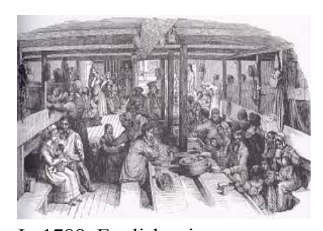
In 1788, English prisoners were taken to Australia. This is the first colonization of the island.