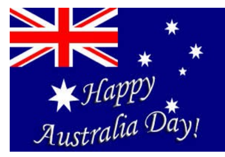
The Australia Day is celebrated on January 26 every year by Australians. It commemorates the arrival of the first European Fleet at became a state of the Sydney Cove in 1788.