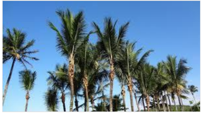
AURELIEN The beautiful Reunionese sunset.