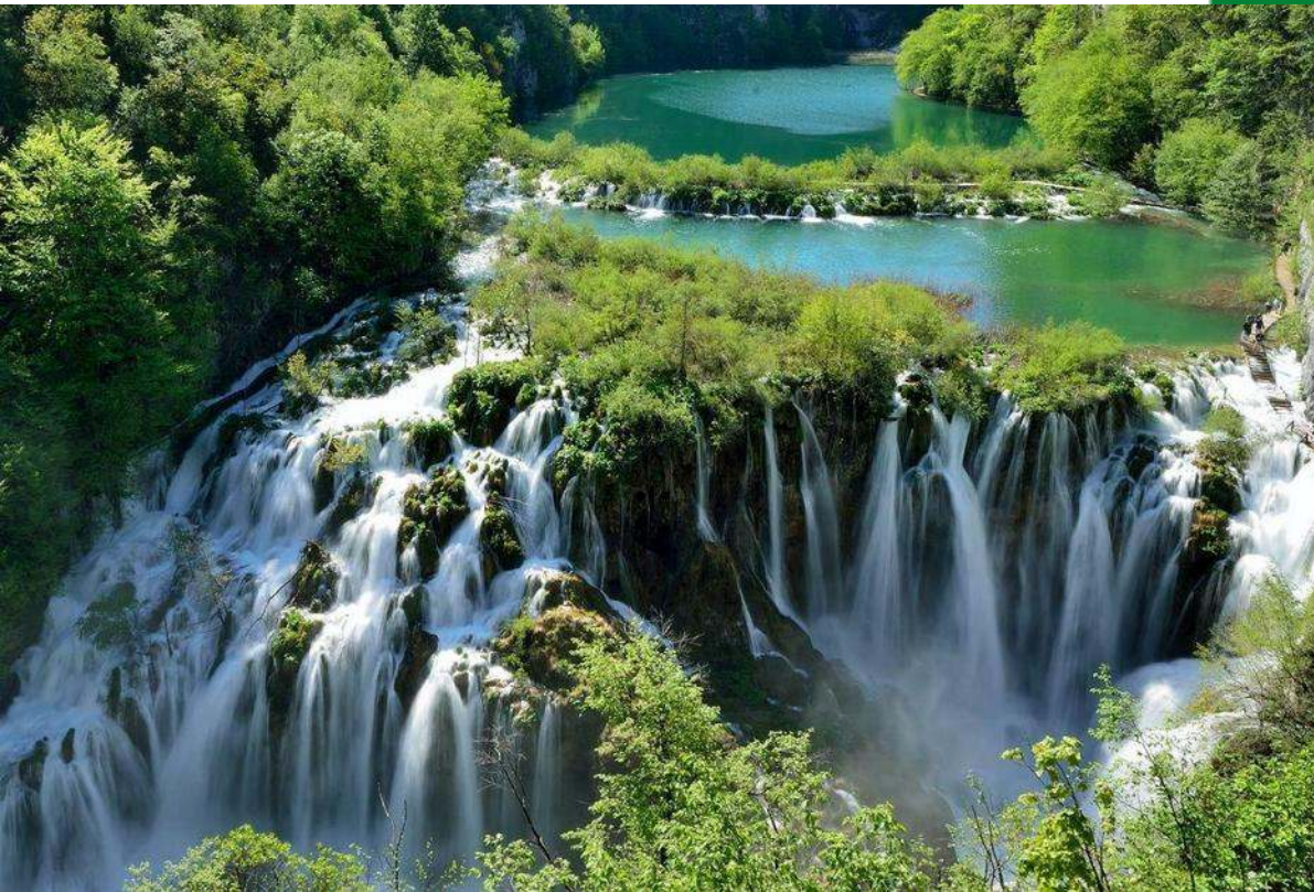
Picture of the lakes under different levels. Lakes are linked with magistral waterfalls !