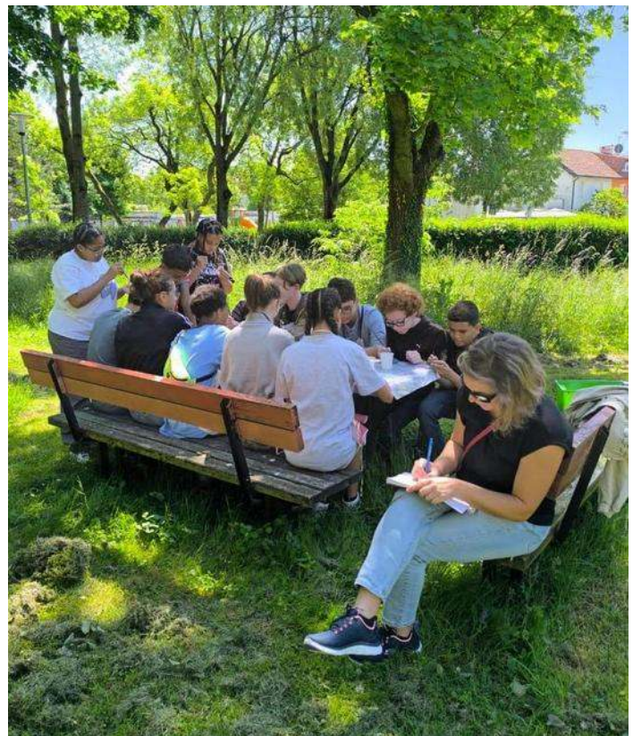
Picture of our painting activity