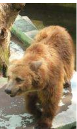
europski bison and bear.