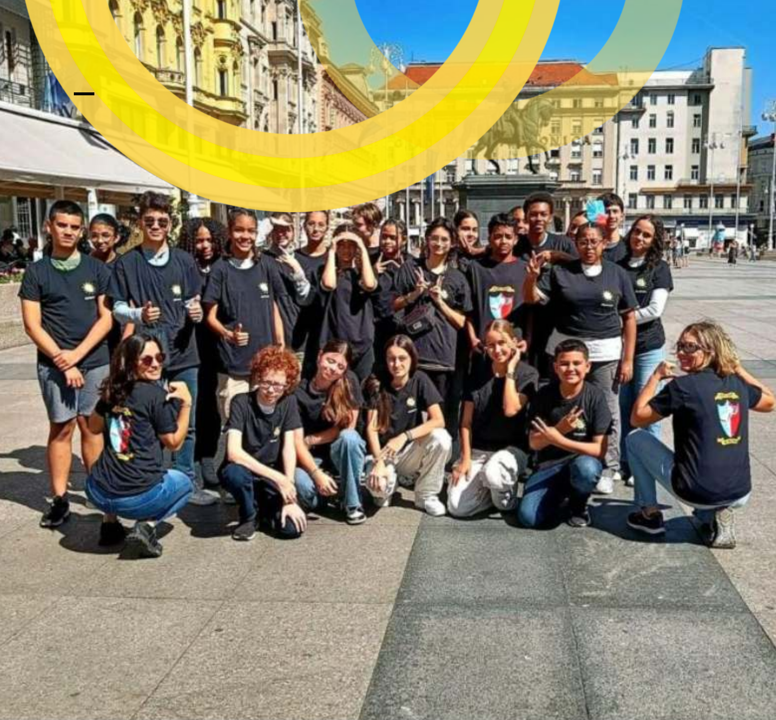
Here is the group of amazing pupils from the British International Section (3e SIB)