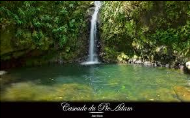
Cascade du Pic Adam 2008 © Alain